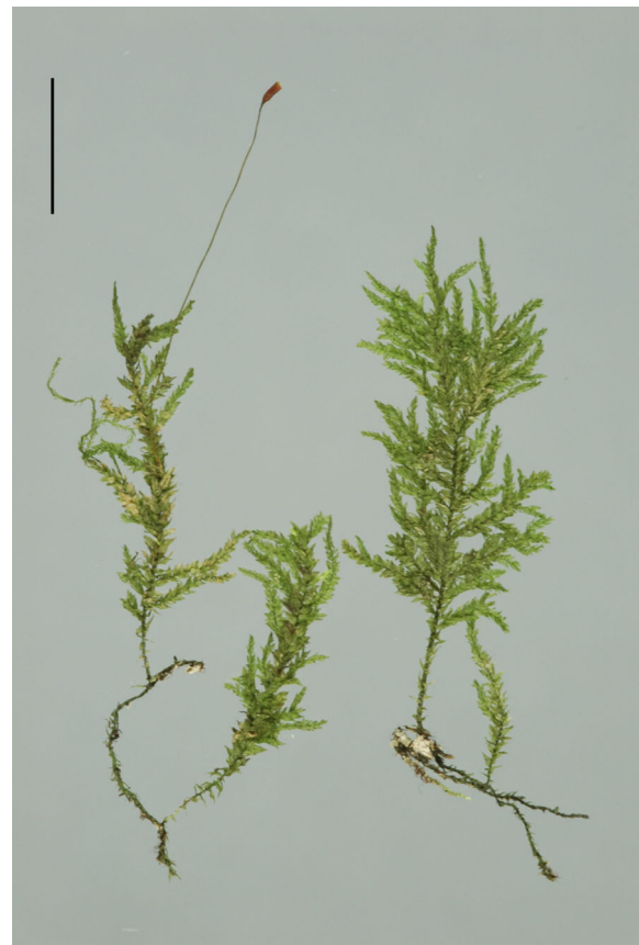
Figure 1. Habit of Porotrichum saotomense (from the holotype). Scale bar = 1 cm.

Dioicous. Perigonia bud-like, on branches and stems; inner perigonial bracts largest, on stems to c. 1.4 mm long, on branches to c. 1.1 mm long, faintly costate, ovate, above midleaf narrowed to a lanceolate-acuminate tip; paraphyses hyaline, uniseriate, filiform. Perichaetia on stems; pre-fertilization perichaetial leaves to 2 mm long, from an ovate, sheathing base narrowed approximately at midleaf to a lanceolate, spreading acumen; costa single, faint, reaching to lower part of acumen at most; margins entire except weakly denticulate near apex; post-fertilization perichaetial leaves to 3 mm long, otherwise as pre-fertilization ones; post-fertilization paraphyses much longer than pre-fertilization ones, hyaline, filiform, mostly uniseriate, few biseriate. Vaginula c. 1.5 mm long, bearing numerous paraphyses and some archegonia. Seta to 2.8 cm long, greenish-yellow, smooth throughout or slightly mammillose below capsule. Capsule erect or inclined, c. 2.0 × 1.0 mm when wet, cylindrical; exothecial cells irregular, mostly penta- to heptagonal, transverse or isodiametric to elongate, c. 15–50 × 15–25 μm; apophysal stomata several, phaneroporous. Peristome